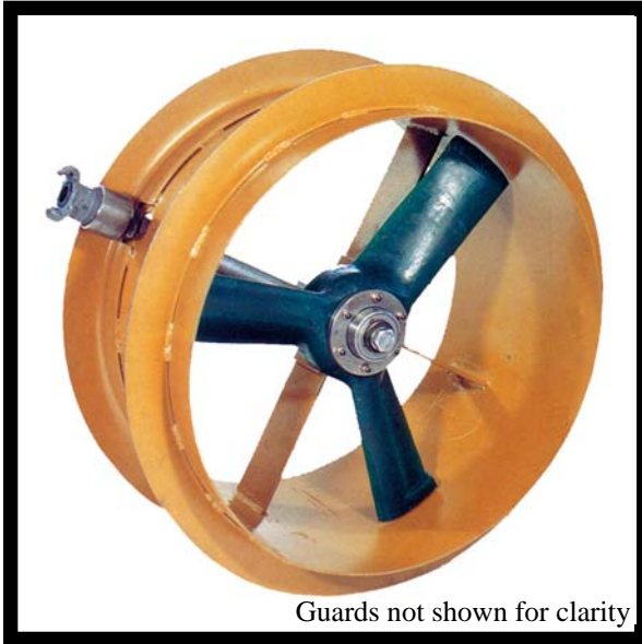
Guards not shown for clarity

COMPLIES WITH MDG No.3 June, 1996 MINES DEPARTMENT APPROVAL No. MDA910091 & 910091/A