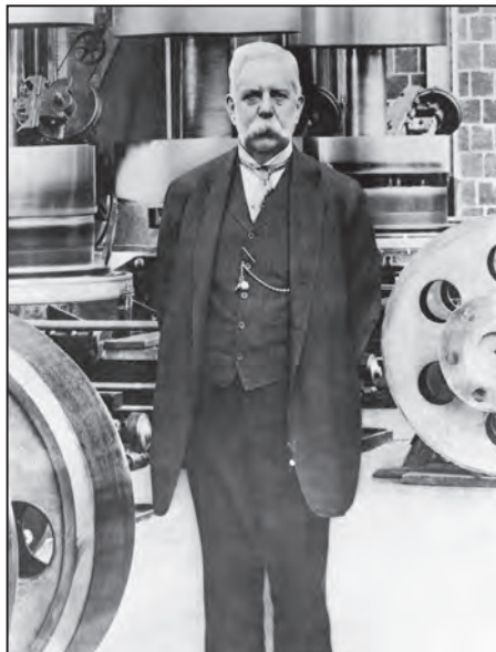
George Westinghouse 1846-1914

In 1886, the American inventor and entrepreneur George Westinghouse amazed the world by introducing the alternating current (AC) electrical system. Today, this same system still provides all your electric light and power needs.