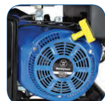
Recoil Starter Handle