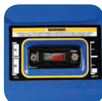
Fuel Level Gauge