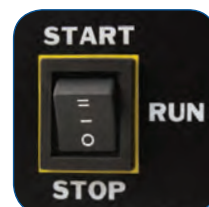
Engine Control Switch