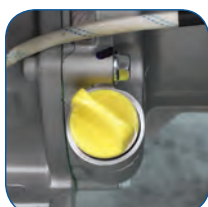
Oil Fill Plug / Dipstick

Westinghouse portable generators are designed to be very easy to start. Simply follow the visual instructions marked on the unit that guide you to the yellow coloured touch points in their correct sequence.